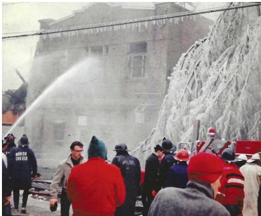
It was a freezing cold day to fight a fire