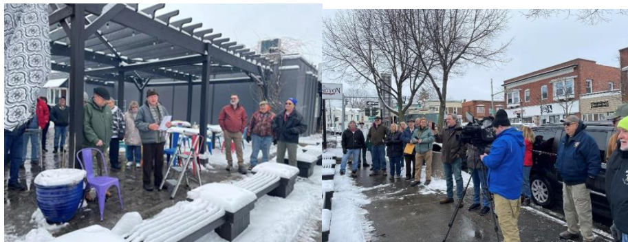
Many firemen and other town people attended the event.